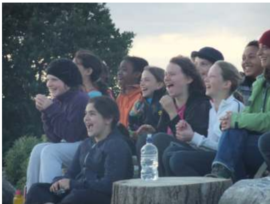
School Journey, 2011